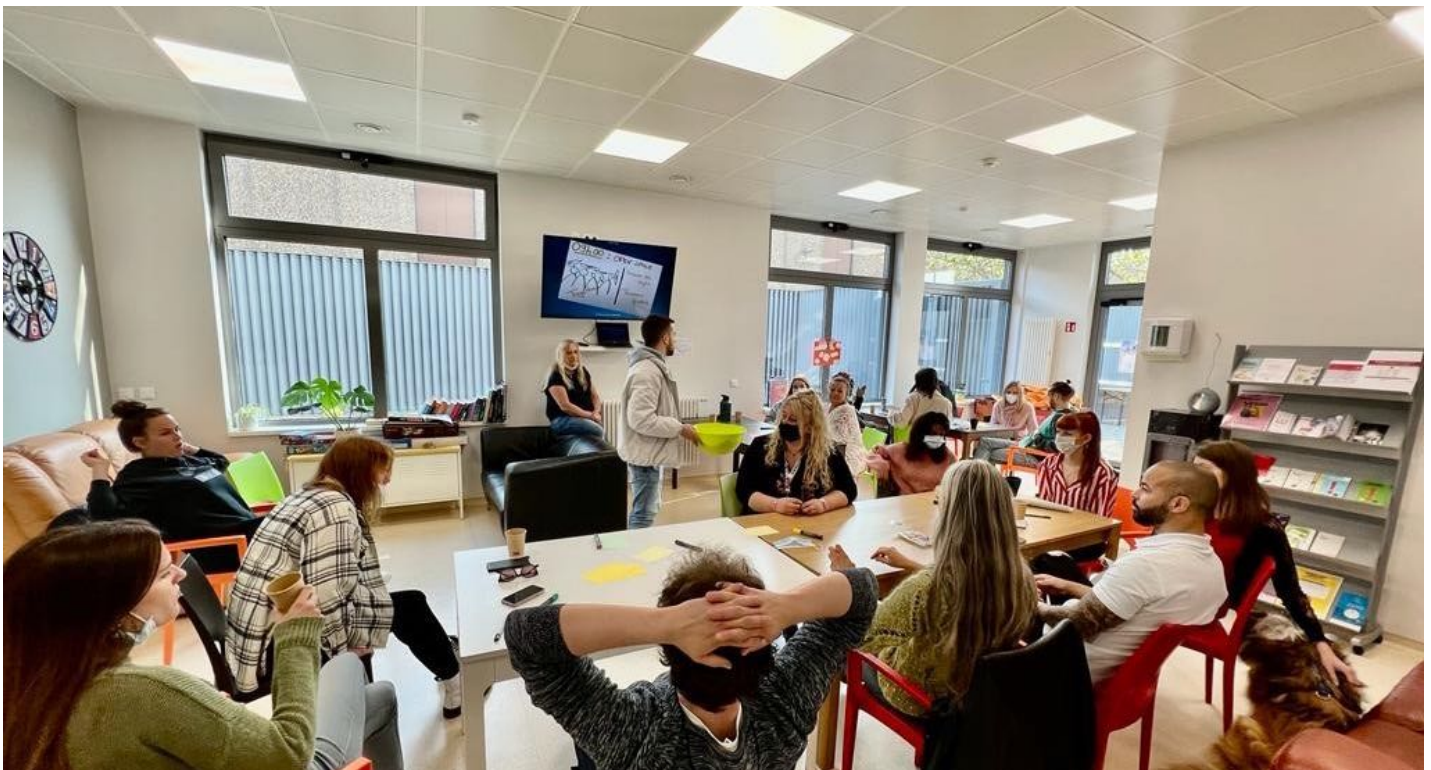
Image 4: A staff meeting taking place at Contact Esch

To access the facilities at Contact Esch, service users are required to sign a contract, ensuring compliance with rules and regulations. The staff at Contact Esch also try to promote good practices wherever possible, such as instructing service users not to gather by the door, but to utilise the terrace instead. As reported by the social worker, minimising visibility to passersby is an important factor, explaining that standing in front of the door could attract unwanted attention and potential issues with law enforcement, disrupting the neighbourhood. She emphasised the need to coexist harmoniously with the community, and that service users are encouraged to respect the privacy and peace of other residents 16 .